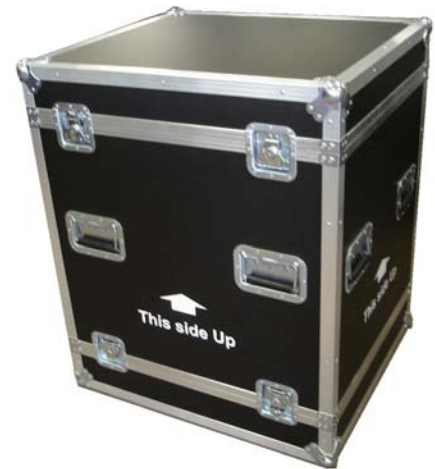
Fig. 5: Carrying Case

The debris analyzer was placed in operational environments with different deployment situations and evaluated by US Air Force personnel at each location.