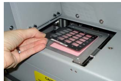
Fig. 3: Sample Sheet Placed in Analyzer

Prototype Debris Particle Analyzer: The debris analyzer is designed to analyze and identify metallic debris obtained from machinery lubrication systems in support of condition-based maintenance of the machinery. The instrument was designed to be compact and modular for ease of portability and to provide automated analysis for front-line use.