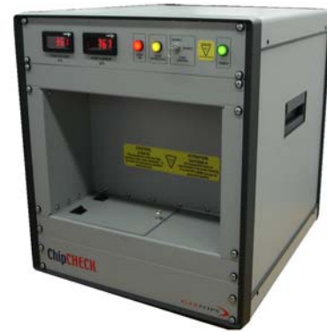
Fig. 1: Portable Wear Debris Analyzer

In 2008, GasTOPS was awarded a USAF Reduction in Total Ownership Costs (RTOC) project to produce an at-line XRF portable wear debris instrument. [6] The RTOC program of work was used to accelerate the product development and create a prototype analyzer that meets the specific requirements of the USAF for aircraft engine diagnostics and prognostics.